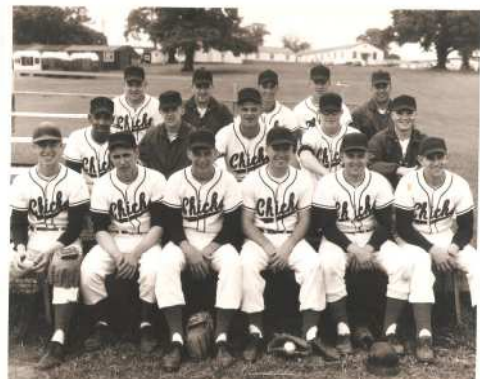
Recognize the guy in the back row, second from our left with the