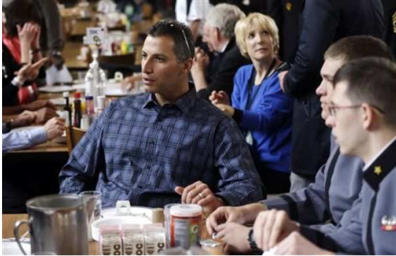
Yankee Pitcher Andy Pettitte having lunch with some cadets.

Turkey doing what we always do; you can fill in the blanks.