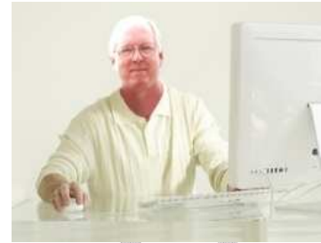
Jan These Days...