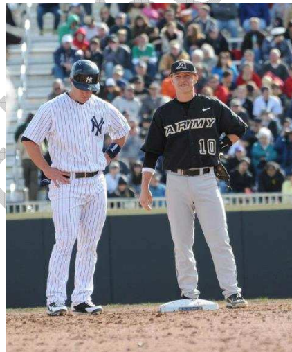
Lot of talking going on