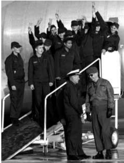
Pueblo crew being released