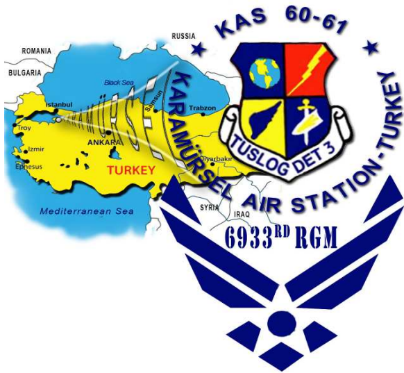
Logo on back of shirt