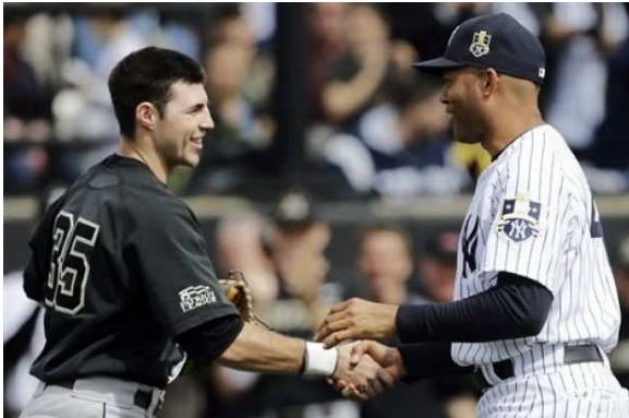
Yankee pitcher Mariano Rivera shaking hands with one of the Army players.