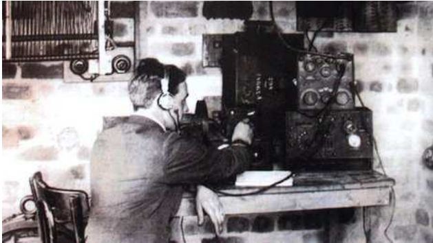
A secret listener at Trent Park, one of a team of about 100 German men