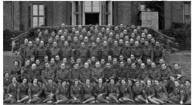
Almost all the men in this image, of Latimer House's staff, were secret listeners

"We felt no guilt - on the contrary, we felt proud to be able to contribute to the British war effort. I'm proud of what we did."